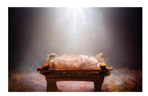
"The Heart of Christmas" Week 3

Christmas celebrates _____ has come _____